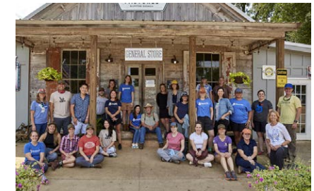
△ Building team capacity for learning: The General Mills Global Impact Team participated in an immersive learning experience on agricultural resilience. They visited White Oak Pastures in Bluffton, GA, where we source protein for EPIC meat products, and saw first-hand the impact that a regenerative approach has on the land, animals and a rural community.

Learn more in the Introduction section of this report.